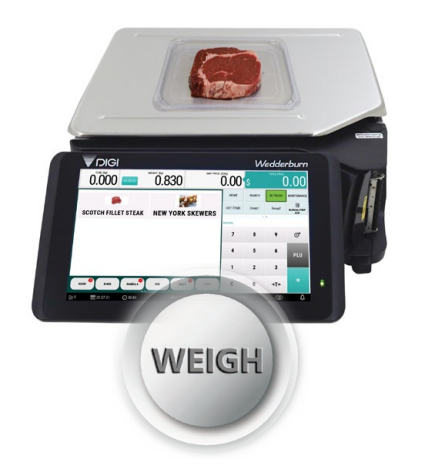
Step 2 - Weigh

Tap eLabel for the product chosen. This triggers a signal for the product's PLU to be transmitted to the scale.