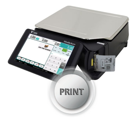
Step 3 - Print

Place the product onto the scale platter and select the relevant icon (PLU) for goods being weighed.