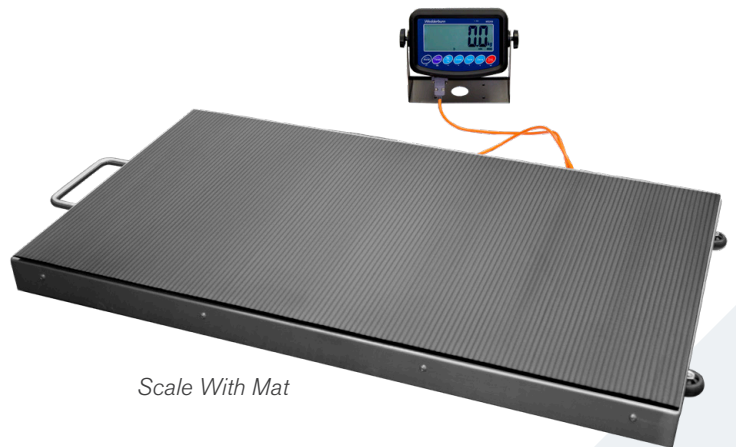
Scale With Mat

Platform Dimensions (mm): 500 (W) x 900 (D) x 45 (H) Net Weight: 15.8 kg Capacity: 300 kg x 100 g