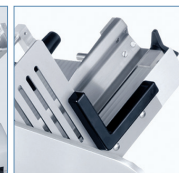
Stainless steel guard