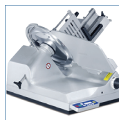
Ample cleaning access