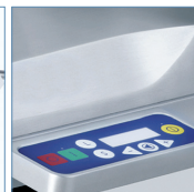
Splash proof control-panel