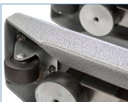
Wheels and Feet