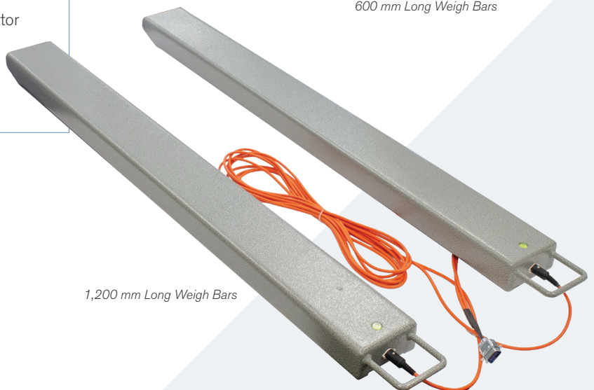
1,200 mm Long Weigh Bars