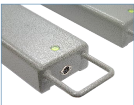
Carry Handles and Level Bubble