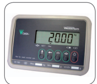
connect to a choice of indicators DI-162 depicted above